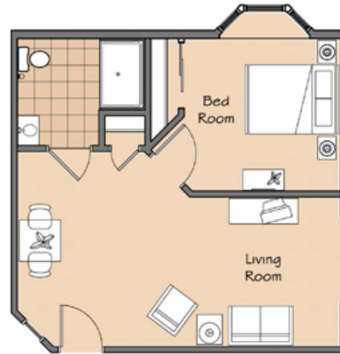
One bedroom B 528 Sq. Ft