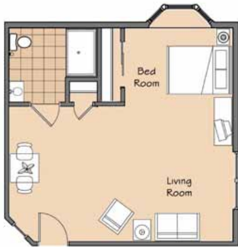
Studio A 528 Sq. Ft