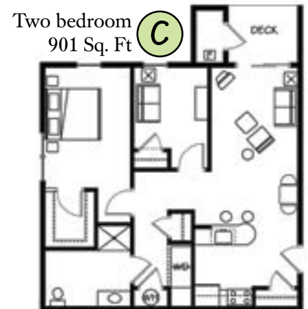
Two bedroom C 901 Sq. Ft