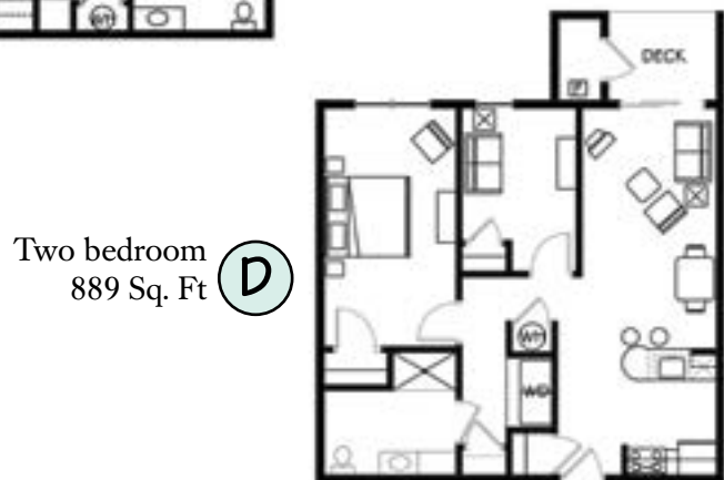
Two bedroom D 889 Sq. Ft