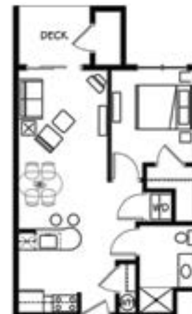
E One bedroom 593 Sq. Ft